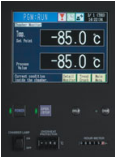
Programming operation type