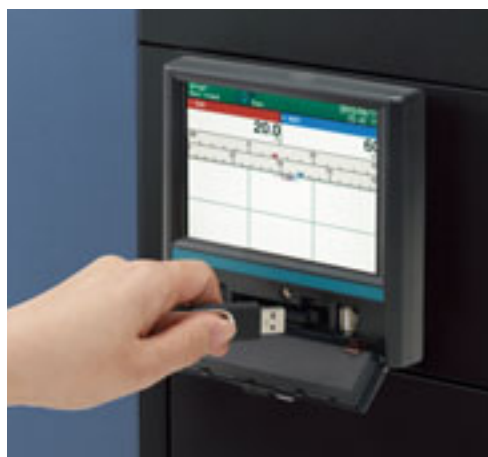
Paperless recorder (optional) *Sample photo