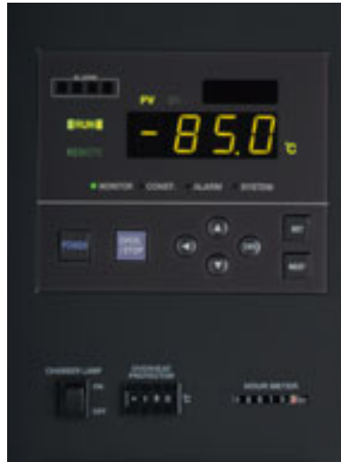
Constant operation type