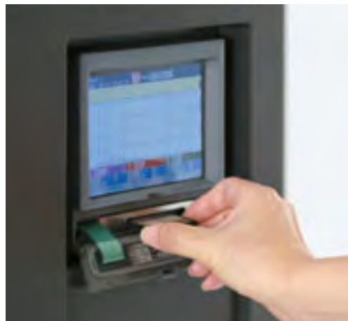
Paperless recorder (optional)