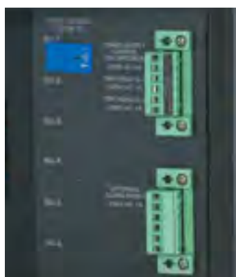
The external alarm terminal is optional.